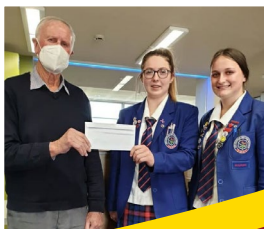
Glory Days